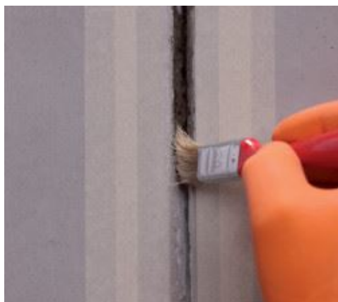
Application of the primer