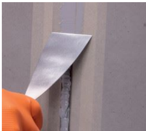
Smoothing over Mapeflex PU40