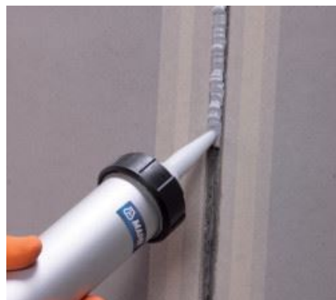
Application of Mapeflex PU40