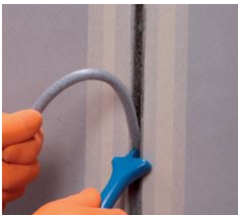
Inserting Mapefoam inside the joint